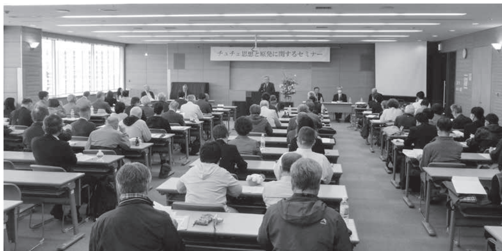
A view of a National Seminar on the Juche Idea and Nuclear Plants Issue (Fukushima, Japan, on April 20, 2024)

Let us accelerate the study and dissemination of the Juche idea by cooperating with Juche idea researchers in individual countries and their respective regions, while making close contact with the International Institute of the Juche Idea.