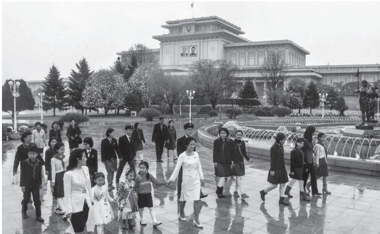
At the Kumsusan Palace of the Sun (on April 15, 2024)