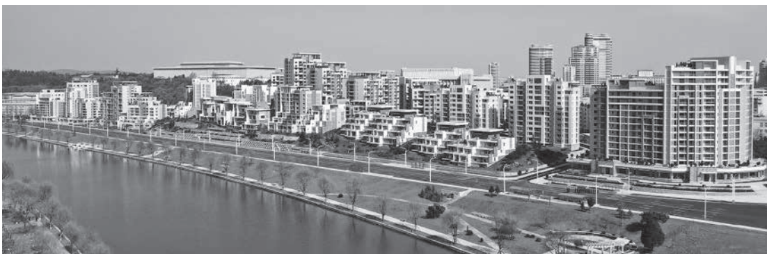
A view of the district of terraced housing along the River Pothonggan

However, the DPRK could lead a happy life to their heart’s contents in peaceful circumstances in the last decade without knowing any wars and their posterity can lead such life in the world nuclear power, thanks to the powerful nuclear forces. At present, the DPRK demonstrates its dignity as a world nuclear power and a military power, and renders