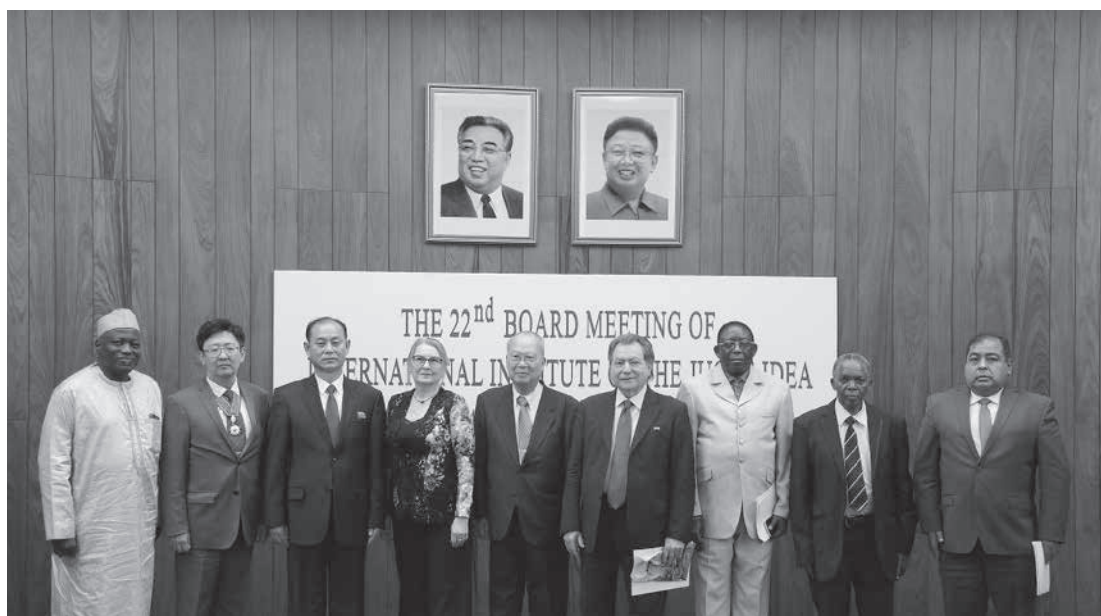
IJI Board members who took part in the 22nd Board Meeting of the IJI (Pyongyang on April 14, 2024)

Even if you say that the DPRK is the country that embodies the Juche idea splendidly,