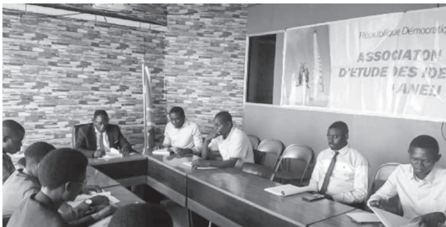
A view of a workshop on the Juche idea held in Kinshasa (in February, 2023)

In this respect, the African Regional Committee for the Study of the Juche Idea has many