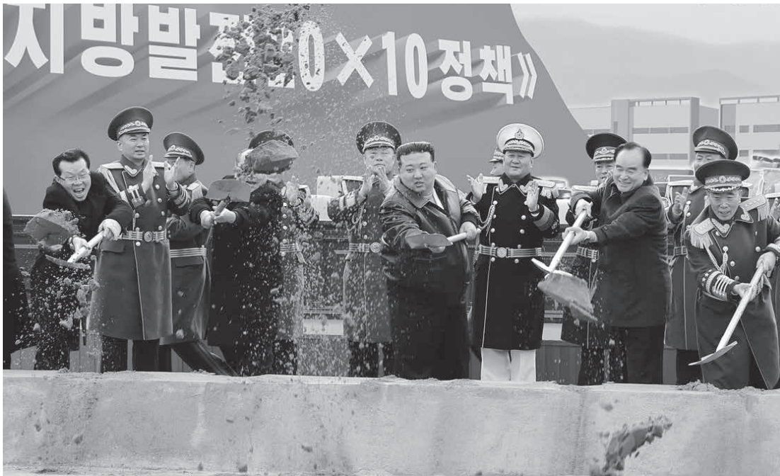
A view of the groundbreaking ceremony for regional-industry factories in Songchon County (on February 28, 2024)