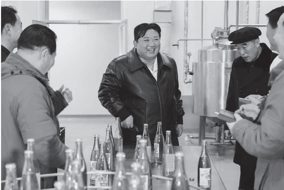
At a local industrial plant in Kimhwa County (February 7, 2024)