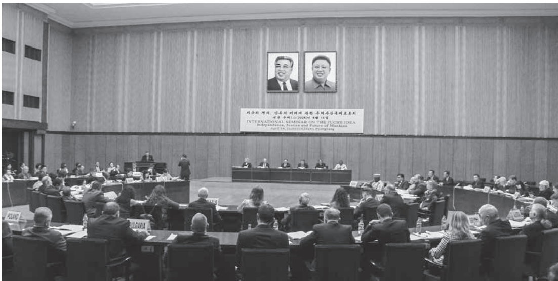
A view of the International Seminar on the Juche Idea for "Independence, Justice and Future of Mankind" (at People's Cultural Palace, Pyongyang on April 14, 2024)

participants in this seminar and the Juche idea researchers throughout the world.