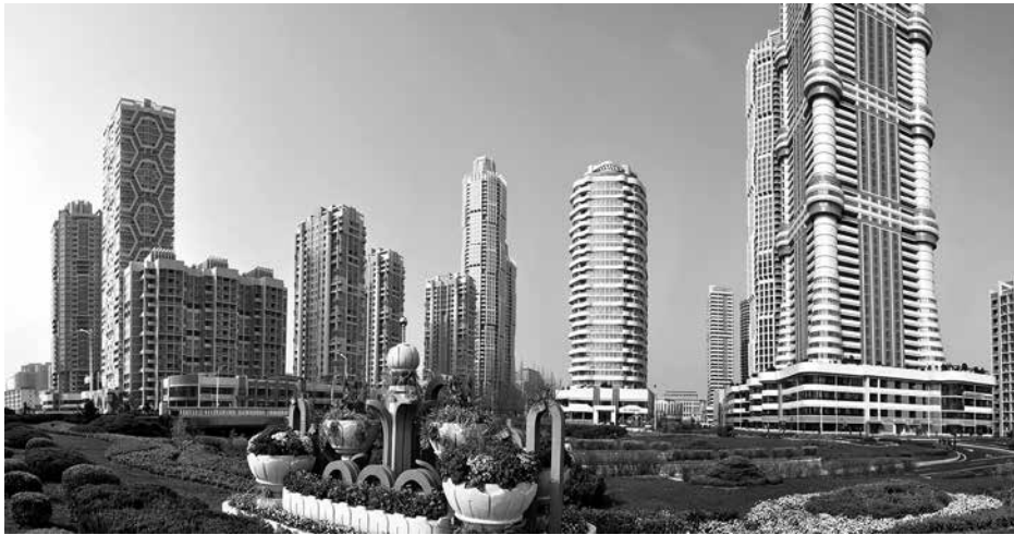
Pyongyang, the capital of flowers, transforming under the leadership of General Secretary Kim Jong Un