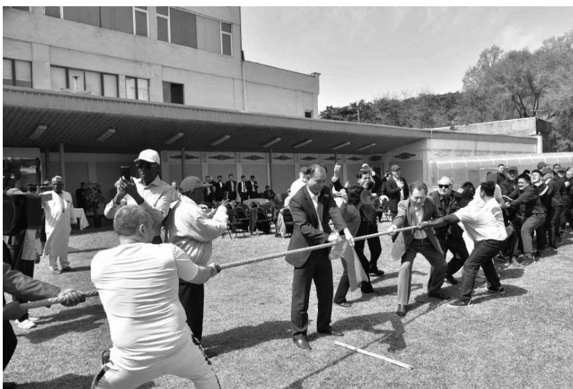
A view of an event for friendship exchanges taking place for the delegates from the world during their stay in Pyongyang

In this context, the Russian politicians put a special stress on the following new phenomenon. In the international arena a special attention is paid to the stand of the countries who have already fallen prey to the West and the close mutual cooperation among them. It is obvious that the efficient cooperation between the Russian Federation and the DPRK is considered in such a situation. A multipolar world is being built by relying on the international organizations of new forms based on the principle of equality. Such organizations