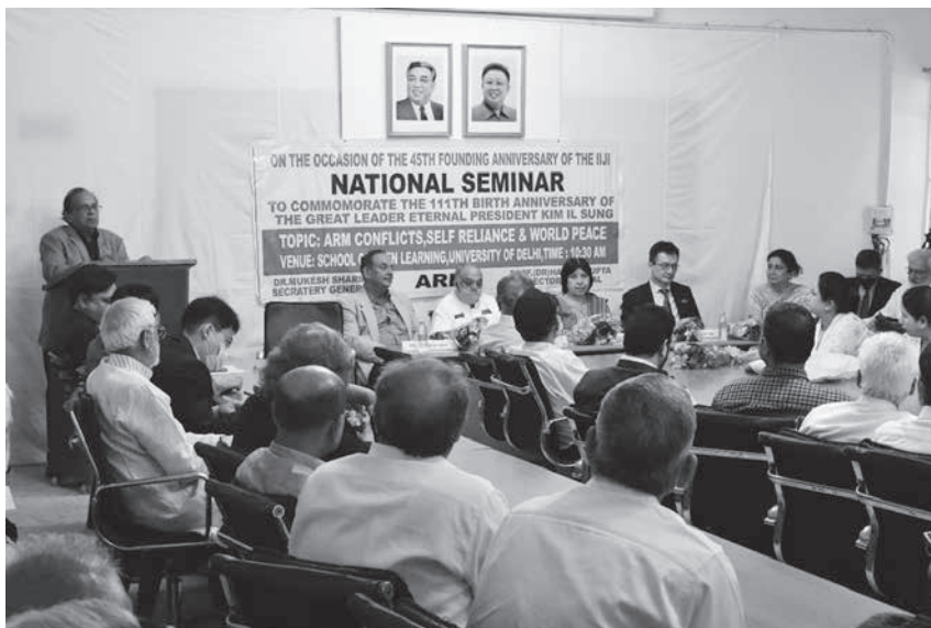
A view of an Indian National Seminar on the Juche Idea (New Delhi in April, 2023)

To develop a sound and balanced modern socialist education system in the DPRK, policies have been framed and necessary steps have been taken by the WPK and the Government to promote primary and secondary school education, specialised higher university and college education, political and ideological education so on and so forth.