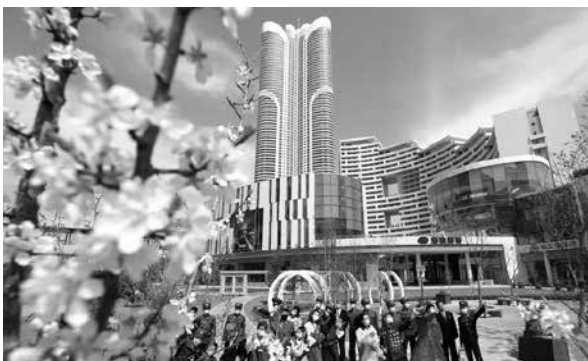
A view of Songhwa Street, Pyongyang

The Party and state maintained consistently the principle of giving top and absolute priority to the people's interests, and in this course, there ushered in the period of the great golden age of construction to provide the people with places for a happy life, thus building modern and new streets, mountainous modern cities and new mountain gorge cities.