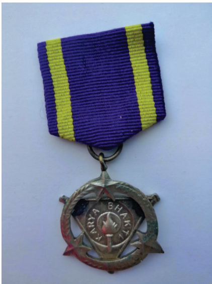
Fig. 6: The Police Active Service Medal or Satyalencana Karya Bhakti, obverse (Private collection)