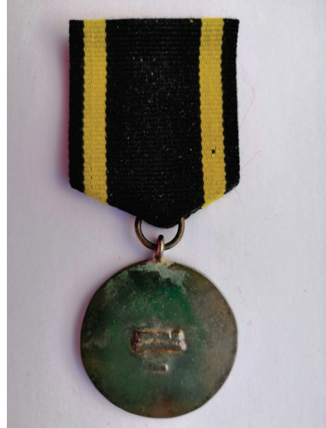
Fig. 2: Police Good Service Medal or Satyalencana Jana Utama, reverse (Private collection)

The Article 4 of the Decree gives a detailed description of the Medal. “Its obverse is a silvery lotus flower. Inside there are two circles. The inside of the second circle has the symbol of the National Police on a red base. At the bottom of the circles there is a ribbon with the words JANA UTAMA. The bottom of the badge has three five-pointed stars as the Tribrata emblem,” i.e. the symbol of the National Police. The Medal is made of gold and silver plated metal. ‘The reverse of the Medal bears the inscription REPUBLIK INDONESIA—The Republic of Indonesia.’ The hanging tape, or Medal bar, is 40 mm long and 35 mm wide with a black base, with both edges given a yellow line 4 mm wide and in the middle there is a lotus flower image 4 .