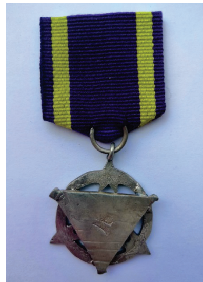
Fig. 7: The Police Active Service Medal or Satyalencana Karya Bhakti, reverse (Private collection)