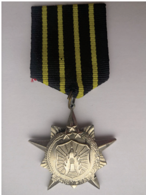
Fig. 3: The National Police Meritorious Service Star or Bintang Bhayangkara, Third Class, obverse (Private collection)

‘The National Police Corps Pole is the Pillar of the State.’ Three stars are pentagonal that reflects the national ideology of Pancasila offered by the first President of Indonesia, Sukarno. The number of stars ‘three’