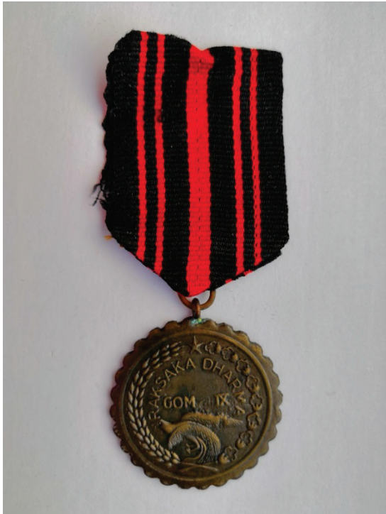
Fig. 8: Satyalencana Raksaka Dharma or Satyalencana Gerakan Operasi Militer IX, obverse (Private collection)