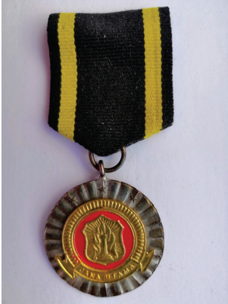
Fig. 1: Police Good Service Medal or Satyalencana Jana Utama, obverse (Private collection).

carry out the noble duties of the police and actively foster police efforts towards perfection' (Article 3, clause 2). The Medal may be awarded twice and thrice. The second Medal is marked by the lotus flower on the medal bar.